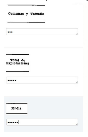
Figure 3. Ex-ante productivity test 2

There were 4 versions of the previous link (one for each treatment condition): "Thank you very much for your expression of interest. Below you can find more information about the position: