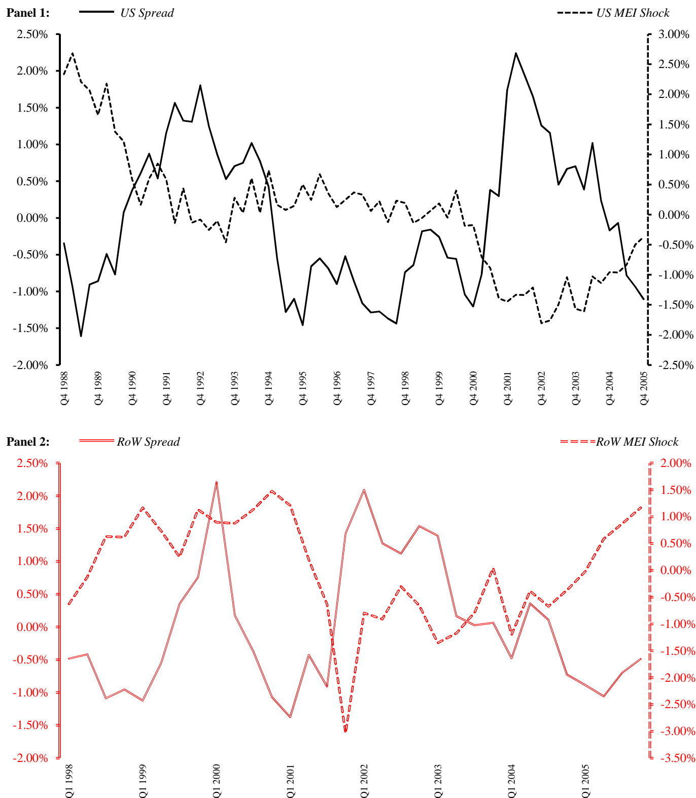
Figure 3: The MEI Shock and the External Finance Premium

Note: The MEI shocks are distilled by applying the Kalman smoother when the parameters are set at the posterior mode. The external finance premium is proxied by the excess of BBB bond yields over the treasury bill rates or government bond yields. All series presented in the figure are standardized.