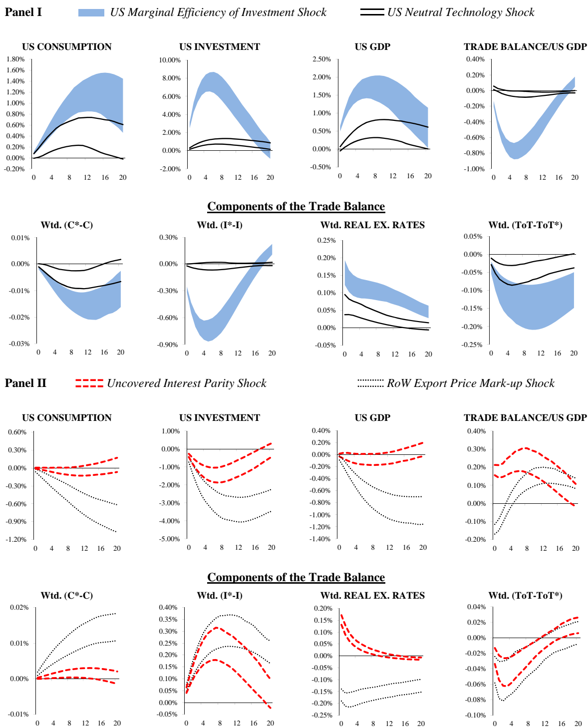
Figure 2: Estimated Impulse Response Functions of Selected Variables

Note: We present the 5th and 95th percentiles of IRFs computed from 150 random draws from the posterior distribution. The aggregate trade balance impulse response is the sum of the impulse responses of the components. The abbreviation 'Wtd.' indicates that the concerned variable has been multiplied by the coefficient in Equation 15 in the main text. Importantly, the coefficient on the relative terms of trade is negative because the estimate of the trade-elasticity is below unity.